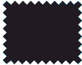
40IM Testa di Moro